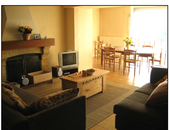
View through lounge/dining to deck