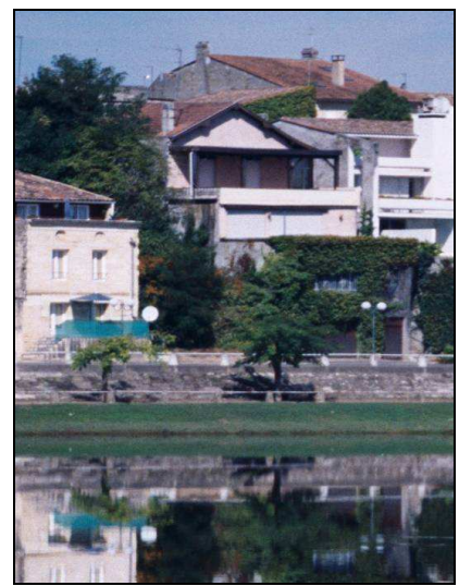
view of "La Liberte" from across river

Welcome to La Liberte ! Situated on the Dordogne River. This bright and spacious home borders the town of "Castillon La Bataille" and boasts stunning 180 degree views of the river and surrounding vineyards. The house is only a 5 minute walk from the centre of town, just 12 kms from prestigious Saint Emilion and 50 minutes from the beautiful and historic city of Bordeaux.