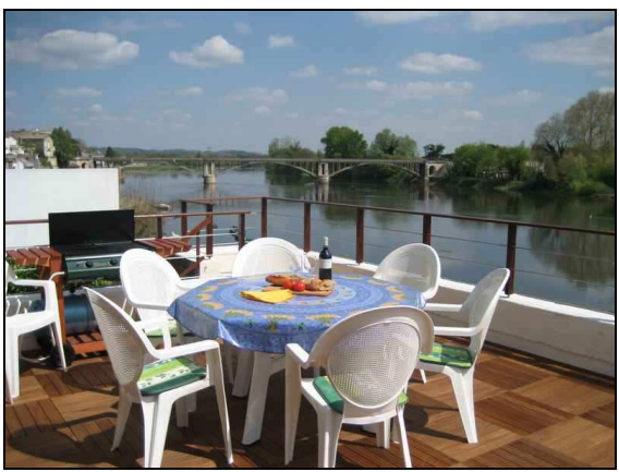
View east from front deck off dining room/kitchen